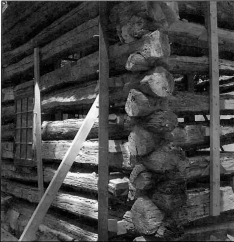
The unique characteristics of inverted V-corner notching, and the “crowning” beyond the points of attachment, indicated original construction of the Church Road Cabin before 1790.

contrast, the notches in the Church Road Cabin are very steeply pitched – often referred to as tear-drop notches - that reflects the appearance of the notch. Such notches are rare on log buildings built after about 1790. Mr. Huber stated that the notches on the Church Road house are some of the very steepest ever seen by Past Perspectives ... going back almost 35 years. This trait was a tradition apparently practiced by first and second generation builders in south-east Pennsylvania. As the years went by, into the late eighteenth and early nineteenth century, the sides of the V became less and less steep - the effect of traditions of later generation builders.