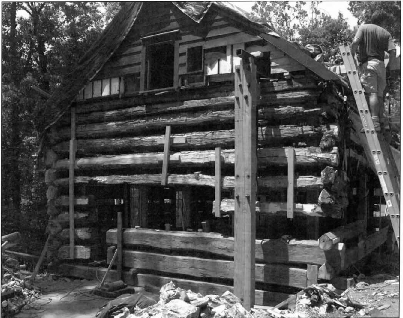
The south wall of the "Church Road Cabin" during its reconstruction. This image, taken July 18, 2008, shows the replacement of the lower logs, all ravaged by insect damage. Many of the upper-level logs were able to be retained despite their age.

The tour with Mr. Huber was very revealing. What most impressed him about this structure was the inverted V-corner notching of the original logs, a treatment not often found in this area. These original logs extend beyond their points of attachments, in a condition called crowning. Most commonly, logs in other area log buildings are flush at the joined points. By